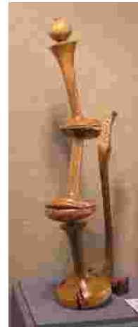
"Bush & Chaney"