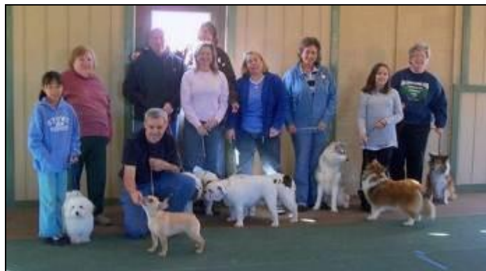
Members of the Saturday Puppy Conformation Class strut their stuff