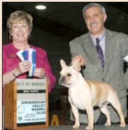
Byrum's A Kiss is Just A Kiss (Bogie) wins in Harrisonburg, VA. Bogie is only 8 months of age.