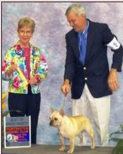
CH Byrum's A Kiss is Just A Kiss