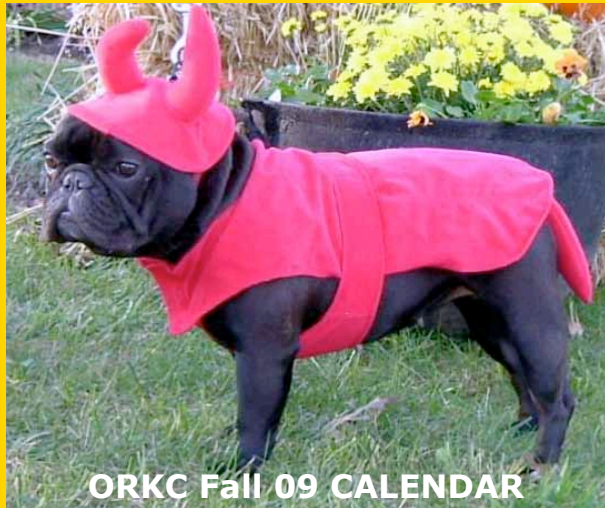
ORKC Fall 09 CALENDAR