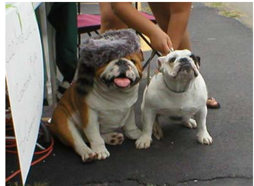
Official SMBC "Greeters" at the Apple Fritter Booth.