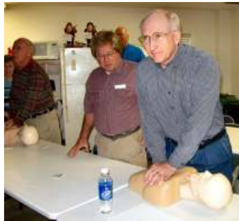
Some members and spouses get CPR training for the next emergency.