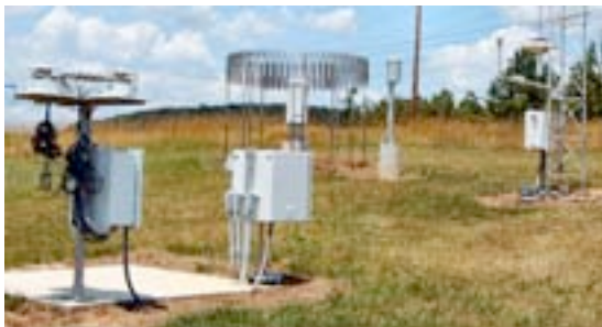
Have Aliens Landed?