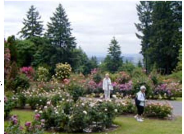
Hella Peterson & Faye Beck Explore the International Rose Garden

"...is not only a place for the cultivation of trees and flowering shrubs, but one that provides secluded leisure, rest, repose, meditation, and sentimental pleasure... The garden speaks to all the senses, not just the