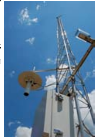
Look, Up in the Sky! It's a Weather Tower...

For now, this NOAA-ATDD weather station is instrumented to collect data on basic environmental stress factors. Over time, the station will be outfitted with more environmental and atmospheric data collection instruments for broader and more elaborate measurements of environmental stress parameters. Oak Ridge NOAA-ATDD will soon provide online historic and current weather reports at their web link at http://www.atdd.noaa.gov . The station currently measures Air temperature (1.5 m height); Relative humidity; Wind speed (10 m); Wind direction (10 m); Surface temperature; Incoming solar radiation; Precipitation; Soil moisture/temperature at 5 cm; Soil moisture/temperature at 10 cm; Soil moisture/temperature at 20 cm; Soil moisture/temperature at 50 cm; and Soil moisture/temperature at 100 cm.