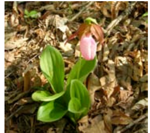
Pink Lady's Slipper (Cypripedium acaule) - Featured Plant for May 4

plants with good fall colors, including fall wildflowers. As more plants are added, the whole catalog collection will grow into a Seasonal Guide to Interesting Plants at the UT Arboretum . We welcome your comments and suggestions on this effort.