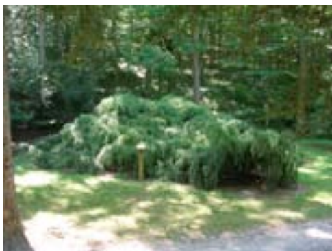
Valentine's Weeping Hemlock

The magnolia orchard was established in the mid-1960's in collaboration with Frank Galyon , a local magnolia breeder, as a research and display area near the Visitor's Center. A principal objective in establishing the orchard was to identify a variety of magnolia hybrids that are late bloomers and thus more tolerant of late frosts. A particular challenge in relabeling these trees has been identifying many of the specific hybrid individuals that no longer have their original labels. At this point, all the hybrids and cultivars that we could identify have been relabeled. Where precise identification cannot be made, we plan to use more general labels, indicating the basic stock from which the hybrid arose – Lily Magnolia, Saucer Magnolia, and Star Magnolia. Besides the hybrids, the orchard has several examples of common cultivars, such as M. stellata 'Ballerina' and M. stellata 'Jane,' and several native magnolia species – Southern Magnolia ( M. grandiflora ), Cucumber Magnolia ( M. acuminata ), and Sweetbay Magnolia ( M. virginiana ). Other native species found elsewhere on the Arboretum include Fraser Magnolia ( M. fraseri ), Umbrella Magnolia ( M. tripetala ), and Big Leaf Magnolia ( M. macrophylla ).