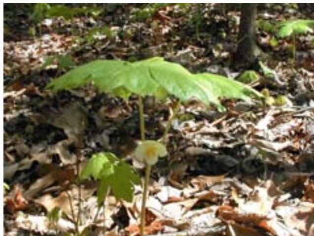
May Apple (Podophyllum peltatum)

Check the Kiosk or the Arboretum Website