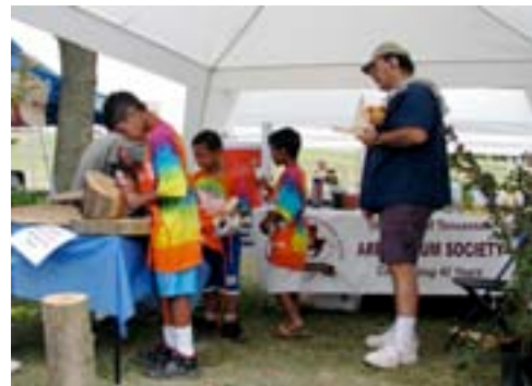
How many rings can you count?