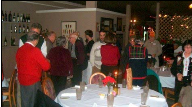
Neighbors mingle before dinner at Catinella's Bistro and Bakery.