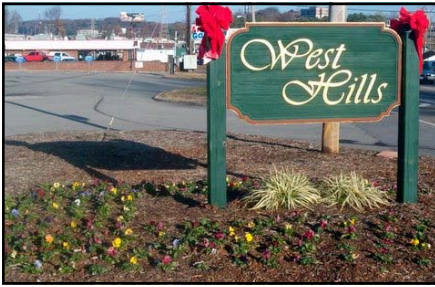
Pansies planted by Wesley Neighbors and Christmas bows attached by the West Hills Beautification Council adorn the entrance to our neighborhood.

After a spring and summer of colorful flowers, the Wesley Gardens at the corner of Wesley Road and Kingston Pike were rejuvenated this fall by the planting of beautiful winter pansies by the Beautification Committee. Additionally, large weeds were dug out, and smaller weeds were poisoned.